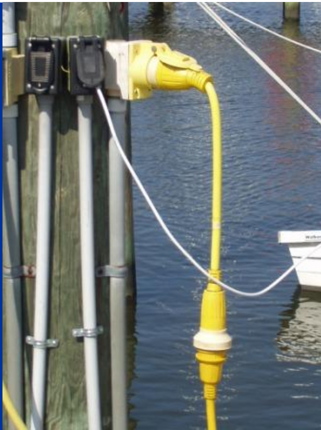
No strain relief. The conductors in this plug can lose contact in the receptacle and become a fire hazard.