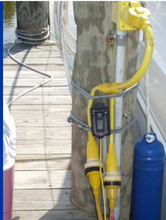
Here some strain relief is provided for the shore cord.